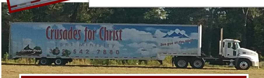
Truck holding the tent and equipment stored in Butler, AL