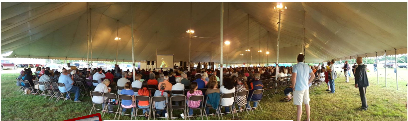
Crusade Crowd under the Tent